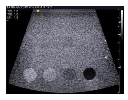
Consistent testing with a Sono410 QC test device...